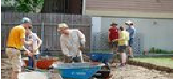
Hard work, making new friends, service in a good cause – what a great weekend!